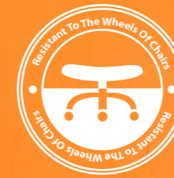
Resistant To The Wheels Of Chairs