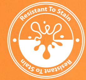
Resistant To Stain