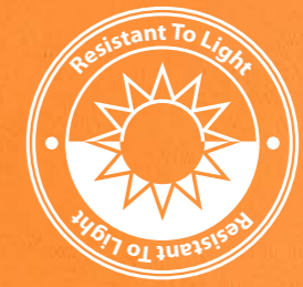
Resistant To Light